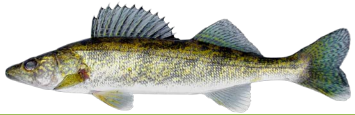
Walleye ( Sander vitreus )